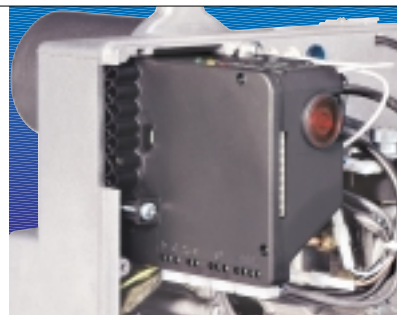
Appliance fitted with an ignition transformer

Electrical connections must be made by qualified and skilled personnel in conformity with the local regulations in force.